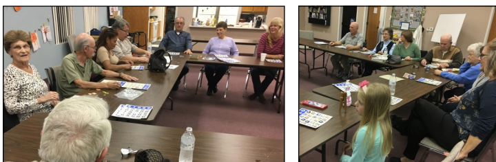
SPRY Bingo in November!